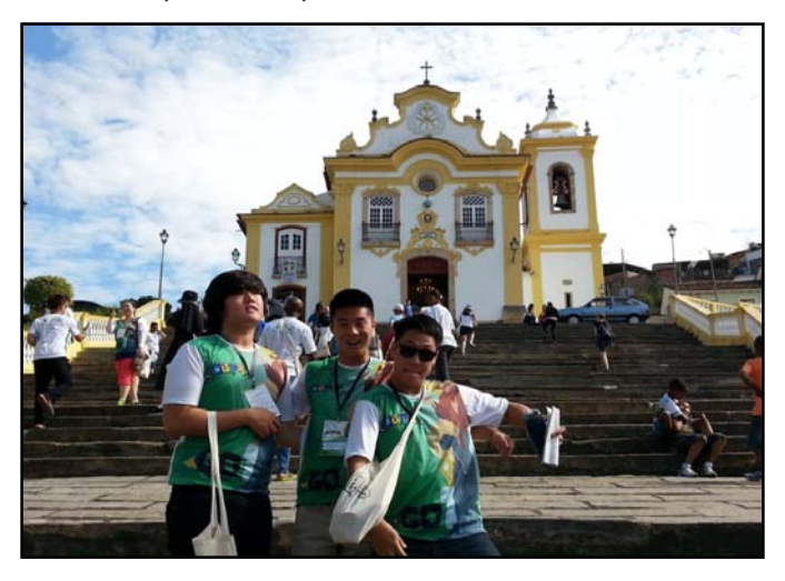
A picture from our tour of Sao Jao Del Rei, a historic town known for its gorgeous churches.

day. It was an incredibly fun experience, but it was definitely a difficult journey. There were many situations where I felt scared and vulnerable, but I've learned so much from each of these situations. I got to meet people from all over the world, try new foods, see amazing sites, communicate with a jumbled mix of English, Portuguese and body language, see the Pope, find close friends, dance and sing songs, and become closer with God. I wouldn't have spent my time in Brazil any other way.