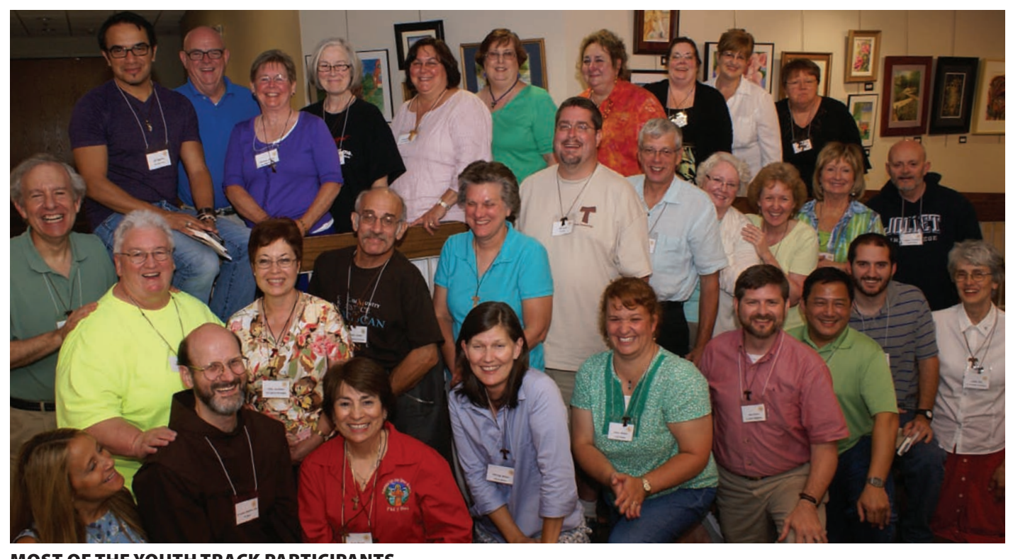
MOST OF THE YOUTH TRACK PARTICIPANTS.