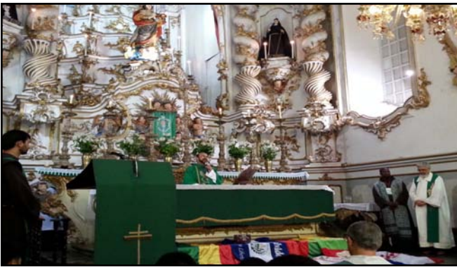
From the Mass of Nations; the altar was surrounded by the flags of every country that attended YIG, which was symbolic of our spiritual unity in Christ.

patience more than anything. Buses were hectically scheduled and always crammed with people, the weather was rainy and downcast, there was more time spent waiting in line than anything else...still, even among the little trials we were constantly faced with, there was clarity to be found. I believe that God had a purpose for everything, and that he tested our patience to in turn teach us the virtue of patience. Be-