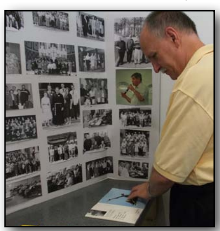
Participants has an opportunity to view historical display boards and memorabilia.