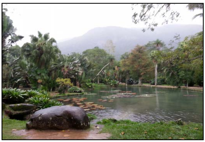
We did some sight-seeing as well. This is Jardim Botanico, Rio's world-famous botanical garden.

was an awesome and humbling experience that showed me just how many other people hold as strong a faith in God as I do, and how we as Christians are not alone; we have all our brothers in Christ all around the world.