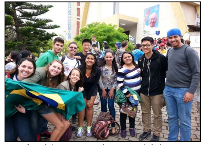
One of the many group pictures we took during World Youth Day.

about YouFra fraternities in many different countries. We shared with each other the problems that youth faces today, as well as the great things that the youth are doing to help society.