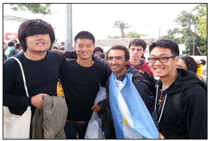
People from all over the world came up to us asking for pictures. It was like we were movie stars!

was an awesome and humbling experience that showed me just how many other people hold as strong a faith in God as I do, and how we as Christians are not alone; we have all our brothers in Christ all around the world.