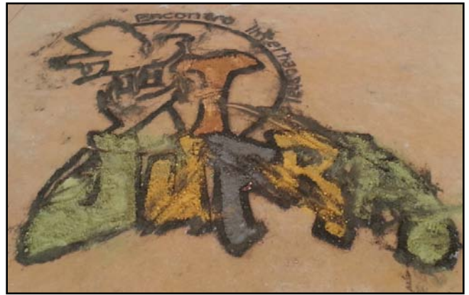
Soil from all over the world was collected and then shaped into this JUFRA (YouFra) emblem.

It's hard to describe how life changing the YouFra International Gathering (YIG) and World Youth Day (WYD) have been, but I'll start by talking about the amazing time I experienced at YIG. I think YIG was a more personal event than WYD, because there were only a few of us from each country, and we were able to grow closer by staying in a school together. As soon as we arrived at the school, other youth Franciscans were extremely welcoming. They cheered for us, gave us hugs and kisses, sang songs for us, and even offered to carry our bags. As YIG continued, we learned