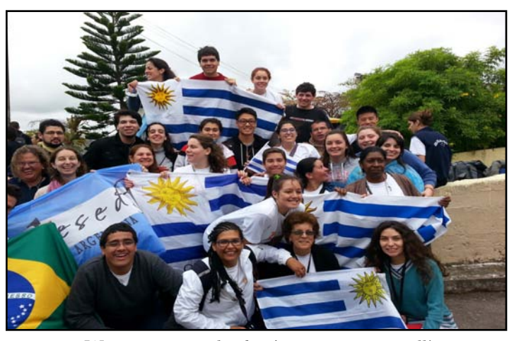
We were very popular for pictures, as you can tell!