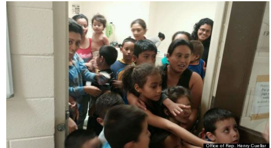
Office of Rep. Henry Cuellar