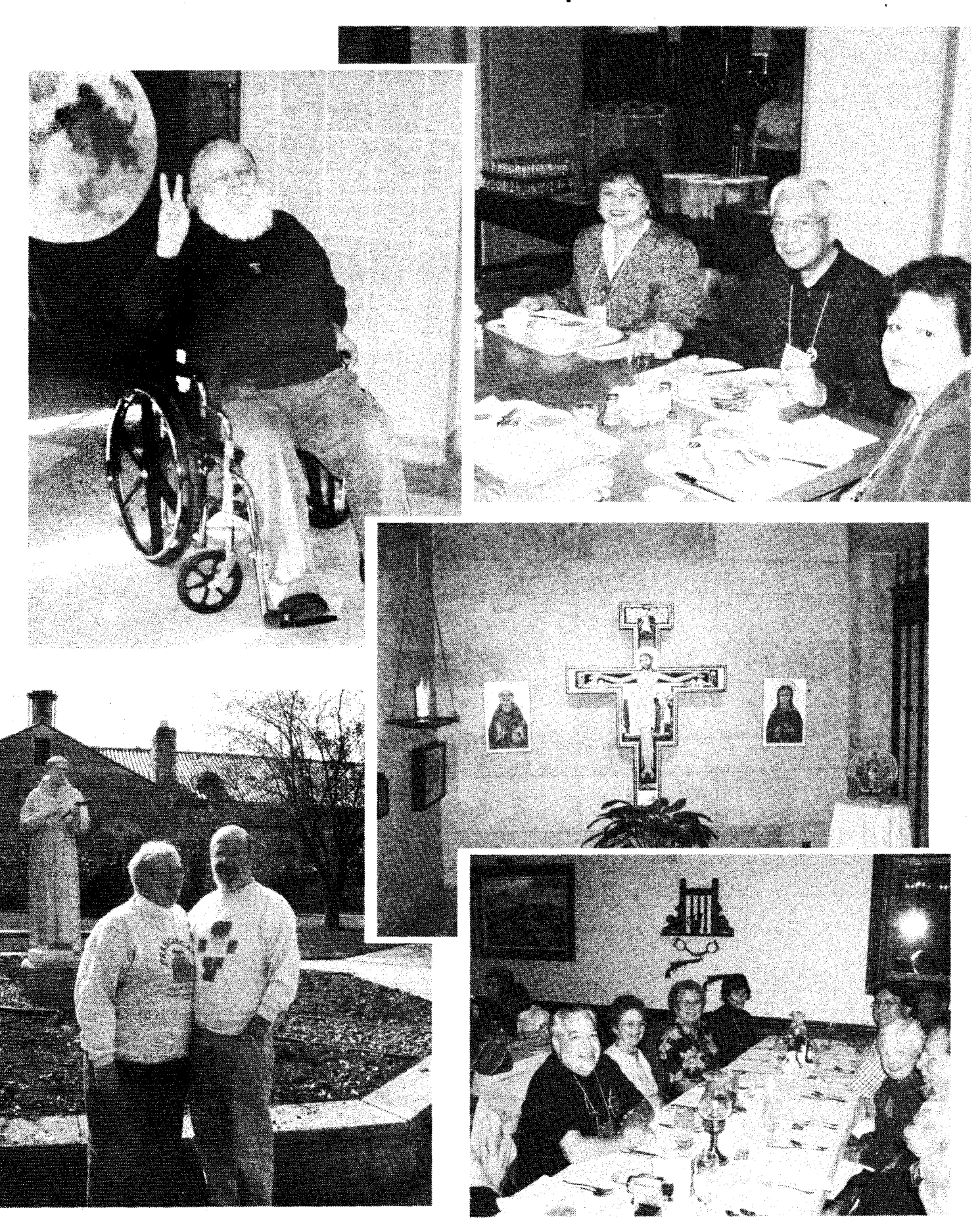
~ thirteen ~