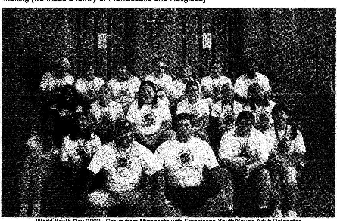
World Youth Day 2002. Group from Minnesota with Franciscan Youth/Young Adult Delegates

Early Saturday morning as the sun was just rising and the fog was slowly burning off, we were joined in Morning Prayer at the GoTrain station as we began our pilgrimage walk Downsview Park for the evening vigil. The train took us a part of the and then walked the remaining 6 kilometers our