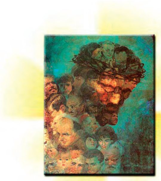
"God created man in His image." (Genesis 1:27)