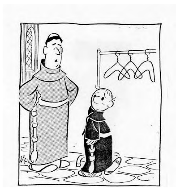
"You okay? All your hangers are sagging."