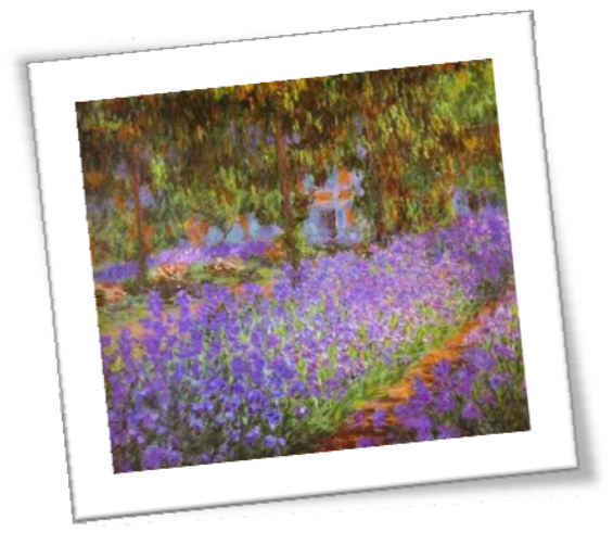
The Irises by Monet