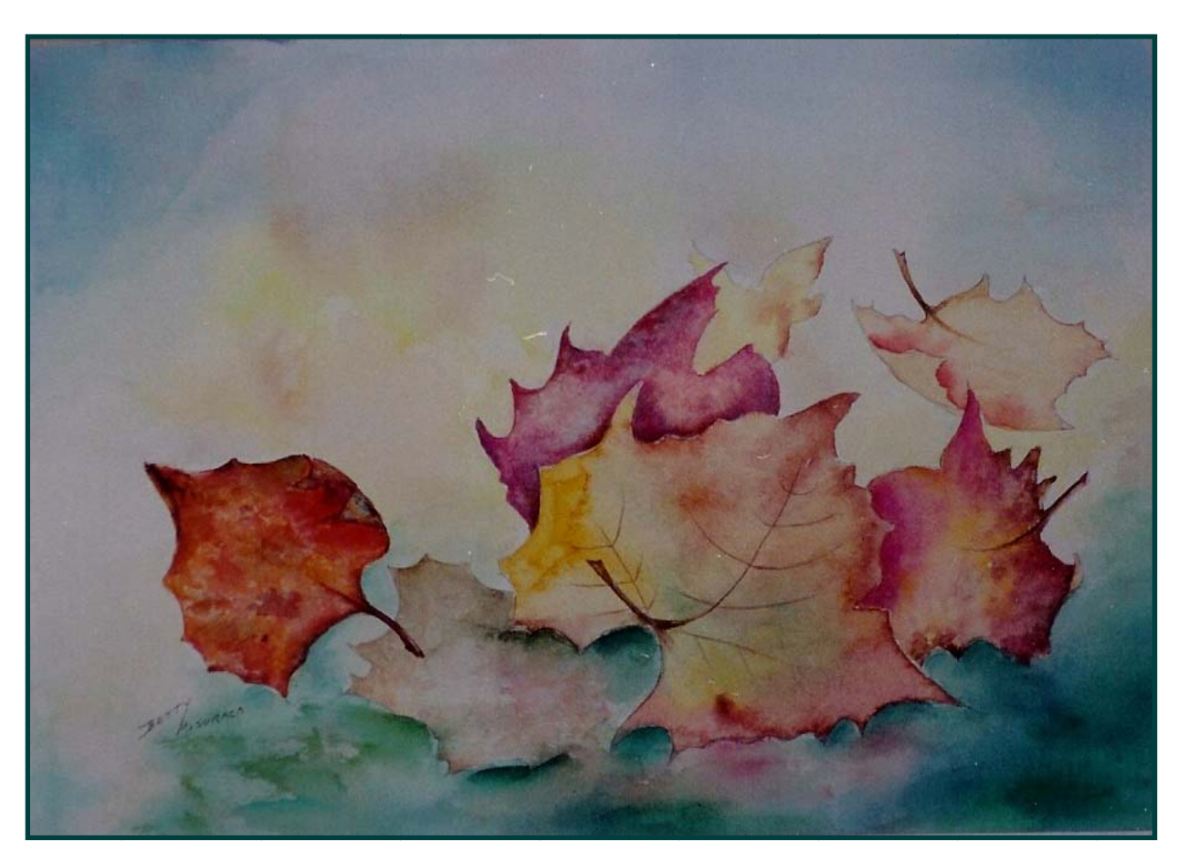
Falling Leaves by Betty Misuraca

Publication of the National Fraternity of the Secular Franciscan Order in the United States Autumn 2009 - Issue 64