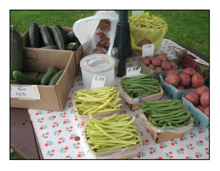
Table with vegetables in front of farm house

"Bless the Lord, all creatures, everywhere in God's domain. Bless the Lord, my soul!" Psalm 103:22