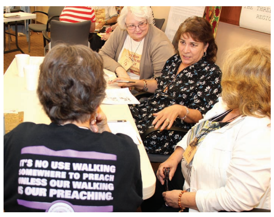
The chapter broke into small group sesssions to tackle agenda topics, such as best practices in regional and local fraternities, leadership development and effective communication.

• "In the best local fraternities, everybody has something to do. Members are engaged."